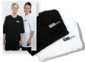
PCA SKIN Lab Coat (black or white)