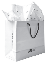
PCA SKIN Bag (set of 25 with tissue)

PCA SKIN® strives to provide all skin health professionals with the tools necessary for safe and effective treatment outcomes. Our Marketing and Back Bar Essentials have been designed to support your treatment success and assist you in building your own brand.