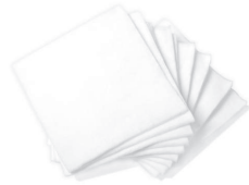
Cotton Squares (4" x 4")