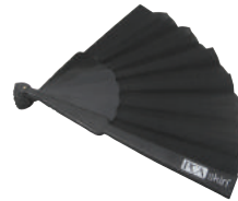
PCA SKIN® Fan