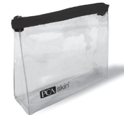
Trial-Size Solutions Clear Travel Bag